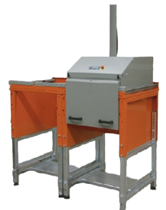
The multiple-chamber unit equipped with an apron with two handles