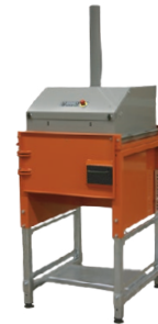
The single-chamber unit with swing door