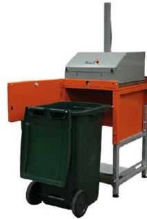
Designed to fit the standard 240 Liter bins in the market.

Model 4240 is user-friendly! The multi-chamber version is a convenient top-loading installation, while the single-chamber version has an easy wheel-in, wheel-out operation. Safety and quality are our hallmarks and the compactor provides maximum personal safety both for the operator and those in the immediate vicinity. A bin indicator assures that the machine can only start, when the bin is in the right position.